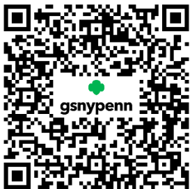
SCAN QR CODE TO VIEW VIA WEBSITE

First published in 2009 by Girl Scouts of the United States of America, 420 Fifth Avenue, New York, NY 10018-2798. www.girlscouts.org